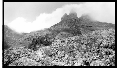
Haggeher Peaks, view from the top, Jan. 2003

On a world map it's just a speck. A place you would never have noticed, but once you do, a whole continent seems to be pointing at it. Soqotra takes pride in its timidity. If the island could speak, native animals and plants would express their high degree of endemicity without bragging. The proudest of trees would puzzle you with his age, granite peaks would sing how they withstood the winds of change, caves would tell stories about forgotten tribes and languages, and the sea would only wave and quickly hide her face behind a deep blue veil.